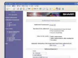
Integrated administrative software provides sophisticated control, yet is easy to use.