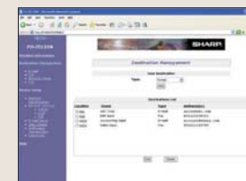
Web-based destination management tool makes it a breeze to add, edit and delete fax numbers, email addresses and folder locations.