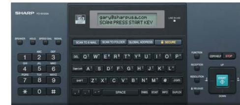
Operating the FO-IS115N Workgroup Document Communication System is easy and intuitive. Easily input e-mail addresses and phone numbers with the QWERTY keyboard and numeric keypad.

The FO-IS115N is incredibly easy to operate, so even occasional users can take advantage of increased productivity. The integrated QWERTY keyboard makes it easy to program numbers and addresses. Sophisticated distribution features have been simplified, so you can send documents with the push of a few buttons. Administrative functions can be easily managed through the user-friendly web page right from your desktop. The intuitive interface allows you to set user preferences, configure network settings and manage destinations.